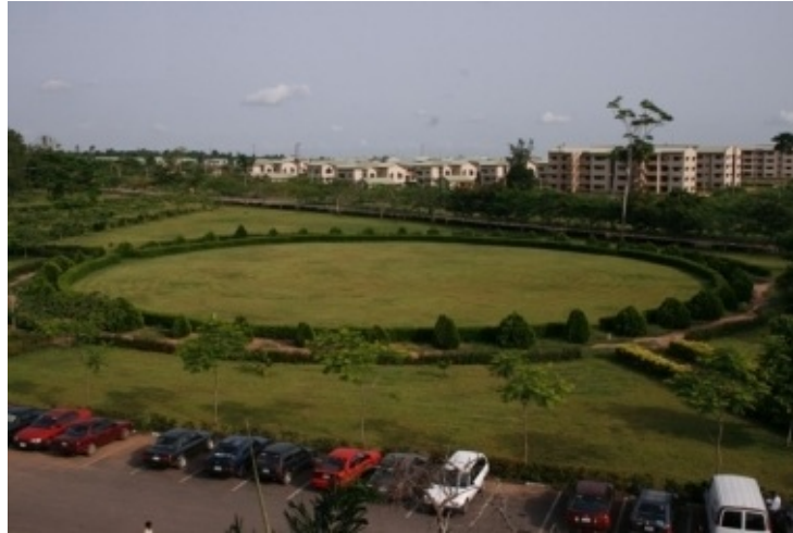
Figure 5: Serene view of Covenant University inside Canaan Land, Ota.

There is a saying that if you chase two rabbits, both will escape.