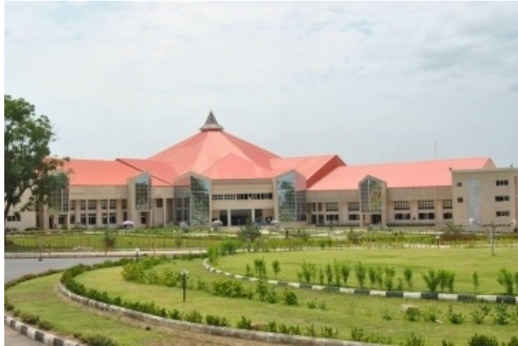
Figure 4: This is the Faith Tabernacle, a 50,000 seat church auditorium, reported to be the largest church auditorium in the world by the Guinness Book of Records.

In the business world we are taught that borrowing is allowed provided it is for profit making. That is great and there's nothing wrong with that.