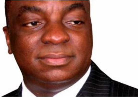
Figure 1: Bishop David Oyedepo

If you are reading this book, chances are that you know Bishop David Oyedepo, or that you have heard about him in the public domain.