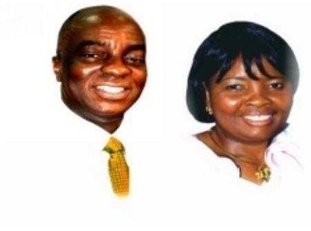
Figure 6: Dr. David & Faith Oyedepo

All men of influence face public scrutiny. There will always be many who feel they should be doing things in certain ways and question the integrity of their actions on many occasions.