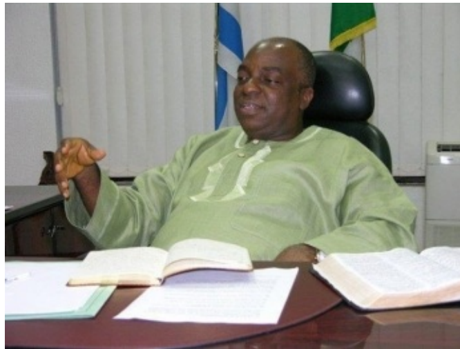
Figure 2: David Oyedepo. "If you don’t want to lose your place in the race, pay attention to reading"

If you don’t want to lose your place in the race, pay attention to reading.